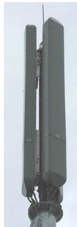
Shown with optional ASC enclosure